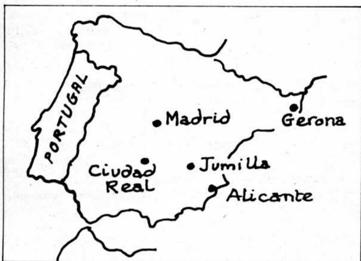
The first encounter

Stretched out on a sort of small cot-like bed, and in a half-conscious, swooning state, she found herself being examined by the humanoids who, as she recalls,